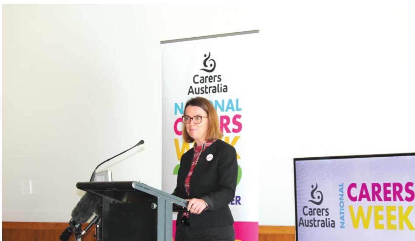
Above // Anne Ruston spoke at the National Carers Week, Carers Australia Breakfast in October 2019.

— Minister for Families and Social Services