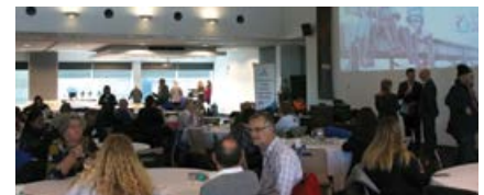
Above // Carers could mingle with one another throughout the day.