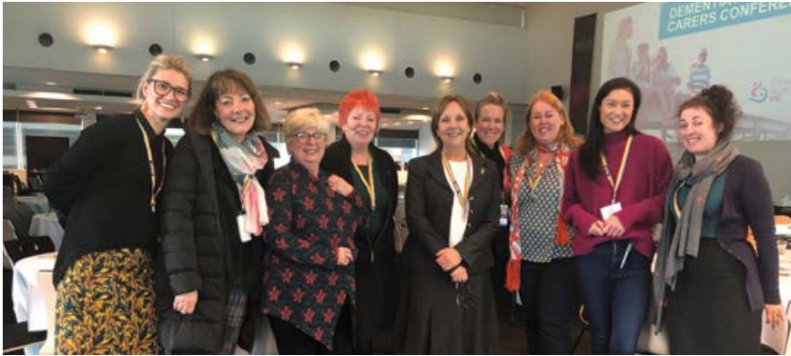
Above // Carers Victoria staff at the conference.