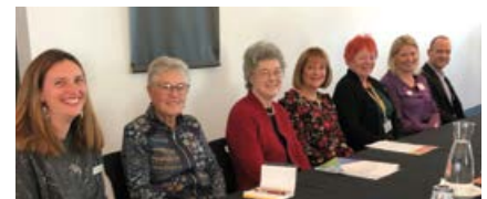
Above // The conference panel ready for a round of discussion with the plenary.

"It was a wonderful day. It was so informative. I learnt many new things. I met a couple of new people. The reception staff were lovely. The MC was great and the way he intertwined the welcome to Country with Carers roles and caring for the country was wonderful. A really worthwhile experience, thank you."